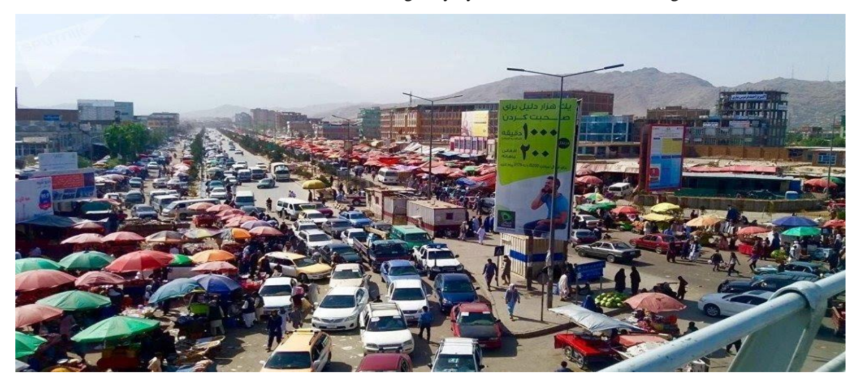
Fig. 3.1 Encroachments of Main Carriageway by Hand Sellers

Occupying the main parts of the carriageway on the urban roads and intersection causes plenty circulation problems for traffic. Stalls and shops use their front areas for commercial activities illegally; buses, vans, taxis, and many more public transport facilities load and unload on the main carriageway; workshops extend the repair areas beyond their rights make problems for smooth movement, and many more kind of encroachments creates bottlenecks situations. Encroachments of main carriageway by hand seller is shown in Fig. 3.2.