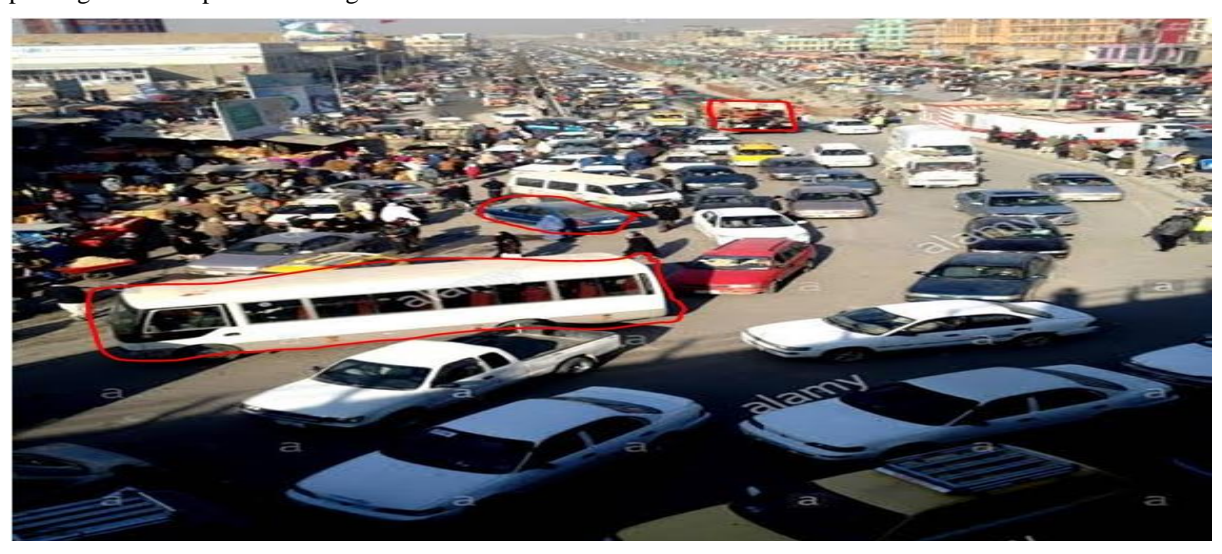
Fig. 3.1 A Sample of Mixed Traffic in an area of Kabul City

increases the accident chances while parking and unparking. Slow moving vehicles most often park near the intersection further complicating the maneuvers for the rest of the traffic. Serious attention is needed for proper parking lots to help in increasing the current situations.